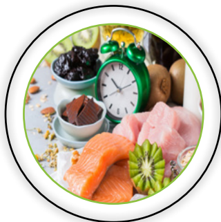
GLYCINE, THEANINE, & GAMMA-AMINO BUTYRIC ACID (GABA)

There are several common ingredients supplement formulators use when creating sleep aids. Each works in a unique way to either promote relaxation, help regulate circadian rhythms, or stimulate sedation.